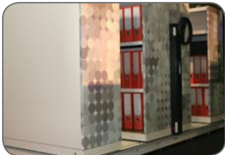
Also available in metal finish

Profile Systems rolling storage units run on a track system that can be laid directly on the floor, mounted on a base or a fixed floor track. Our rolling storage units can be operated as a manual, mechanically assisted or electrically powered unit. Profile Systems rolling storage can be designed to accommodate almost any space. Unit height can vary and is determined by the type of media being stored and any Occupational Health & Safety considerations.