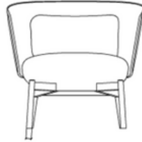
W810 x D915 x H715 x SH420