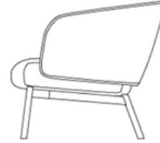
W810 x D915 x H715 x SH420