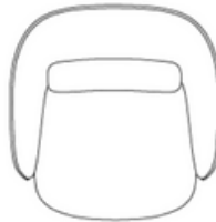
W810 x D915 x H715 x SH420