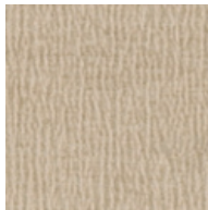
CITY - 120