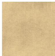
OTE DECENT 02