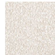
MAYA A2267 2A