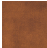
OTE DECENT 26